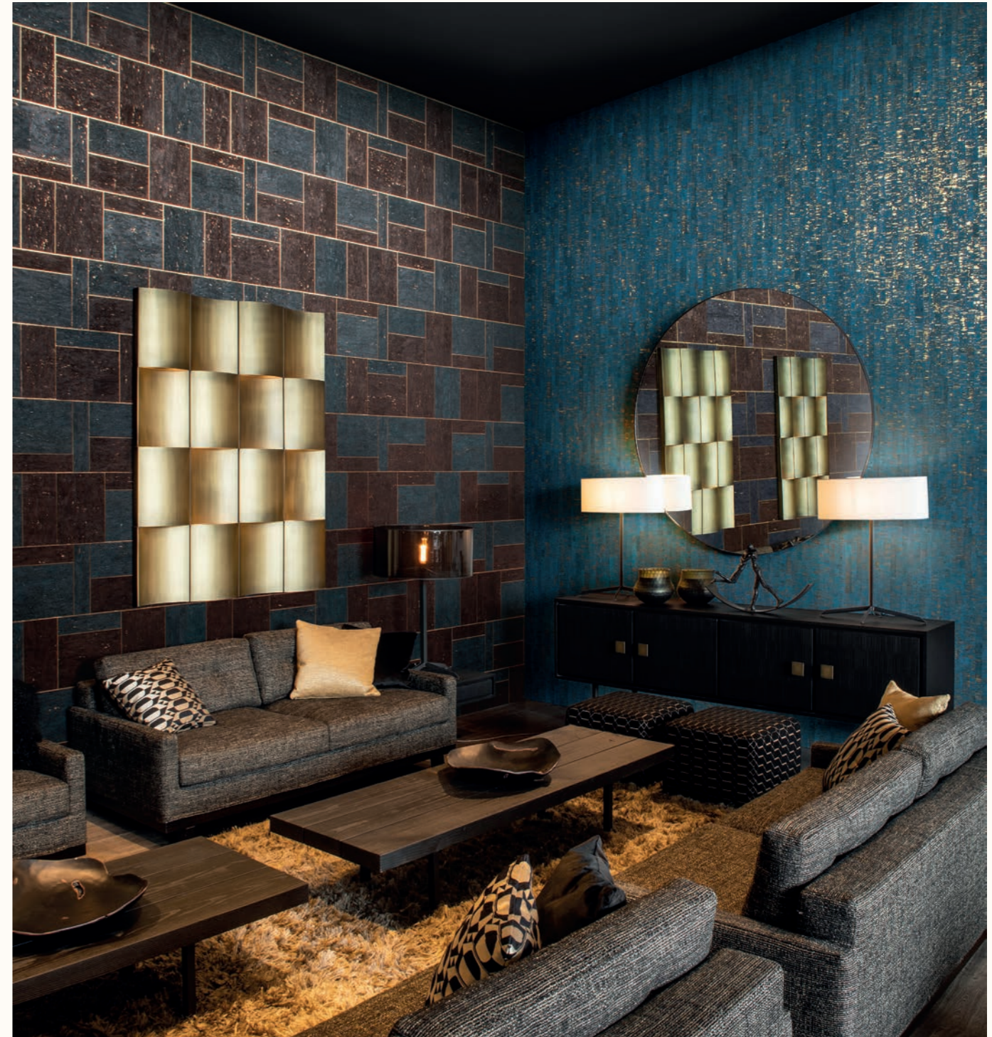
KHATAM, KHA24 & KHA51