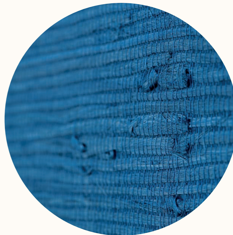
SERAYA, SRA422 I

NATURAL PRODUCTS «Paying tribute to natural materials, imperfectly formed over a lifetime...»