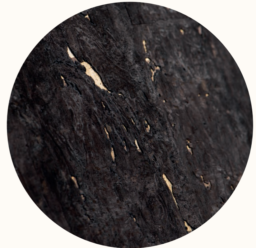
KHATAM, KHA I 5