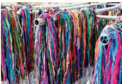
RECYCLED SARI SILK