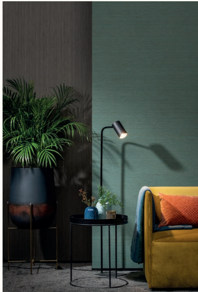
PORTFOLIO, POR3008 & POR3007