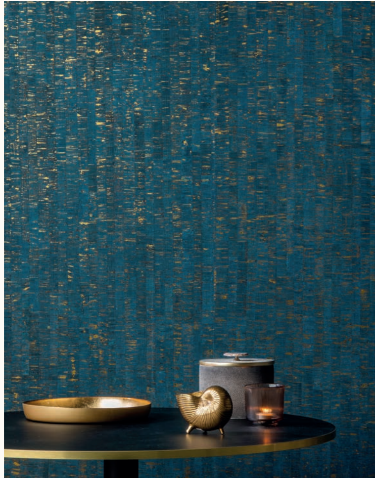
KHATAM, KHA 5 I

Each leaf is delicately placed by hand onto a sophisticated geometric design.