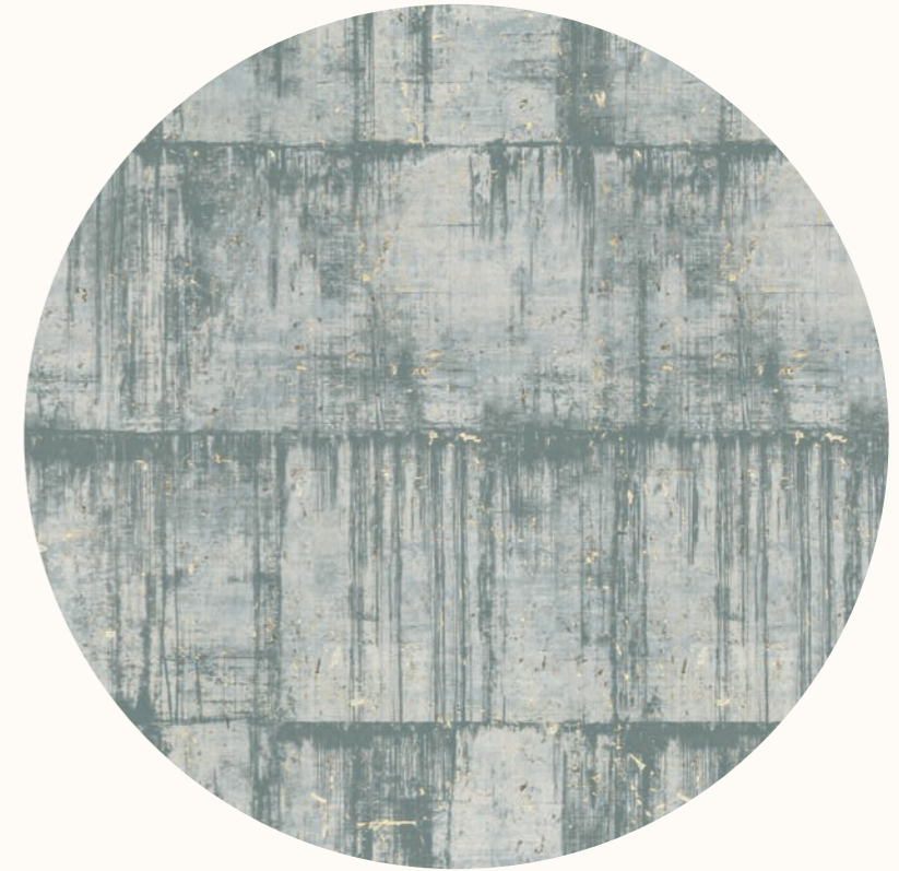
KHATAM, KHA 3 3

Bark from the cork oak is harvested, combined in block form, and then cut into delicate leaves.